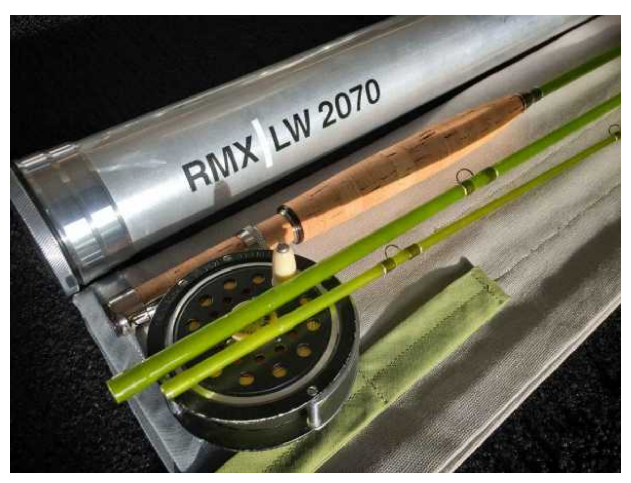
Possible Grand Prize? Custom Built By Our Own Shawn Gordon – A 7'6' 4/5wt.