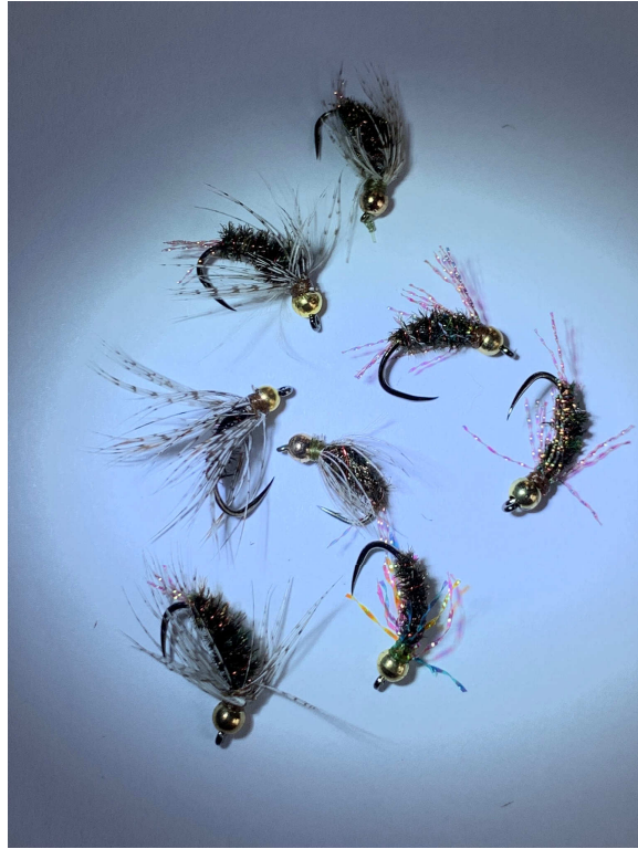
Collar: partridge soft hackle or Krystal Flash